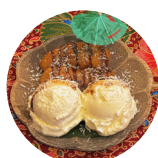
Pisang Goreng with Ice Cream