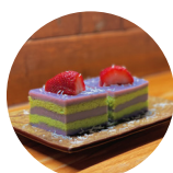
Taro Pandan Layered Cake