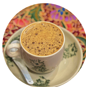
Ipoh White Coffee