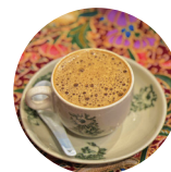
Ipoh White Coffee