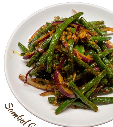
Sambal Green Beans