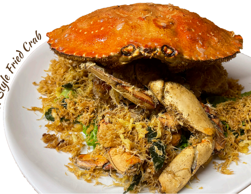
Golden Style Fried Crab