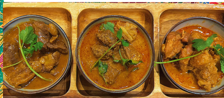
Deluxe Curry Platter