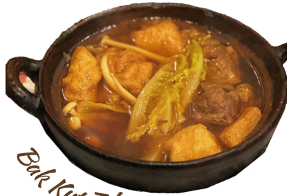
Bak Kut Teh