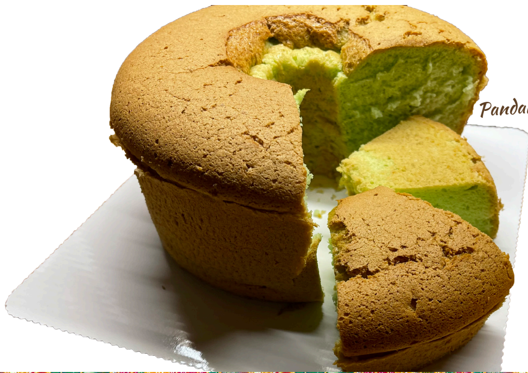
Pandan Chiffon Cake