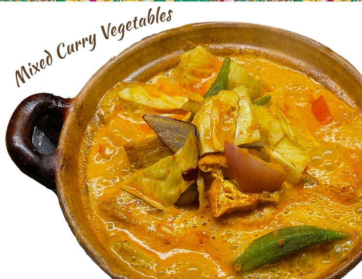
Mixed Curry Vegetables