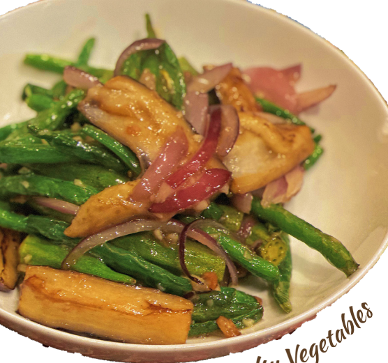
Malaysian Specialty Vegetables