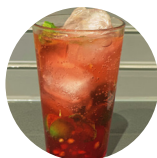
Rose Syrup with Calamansi