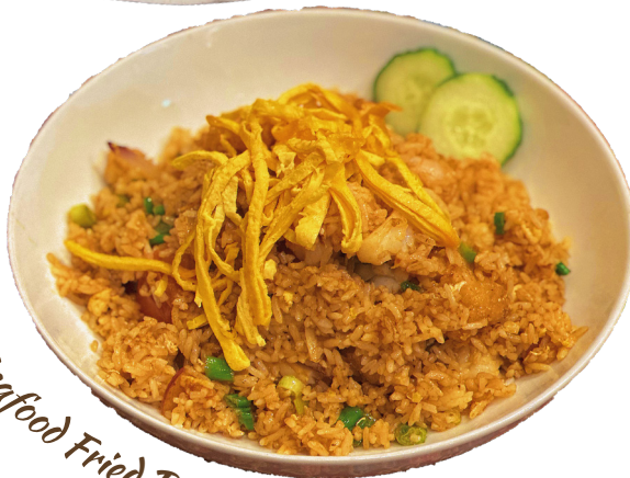
Tom Yum Seafood Fried Rice

Boneless steamed chicken with beansprouts, and Hainanese rice on the side. Available for lunch & weekdays only.