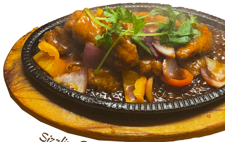
Sizzling Pork Chops