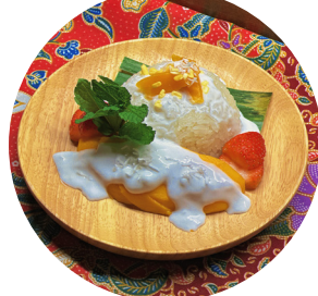
Mango Sticky Rice