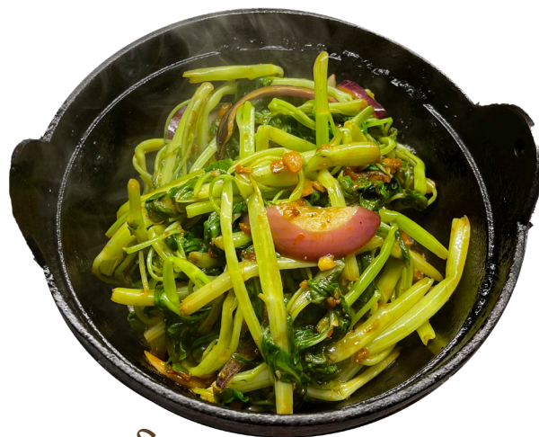
Sambal Kang Kong