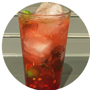
Rose Syrup with Calamansi