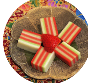
Nine Layer Cake