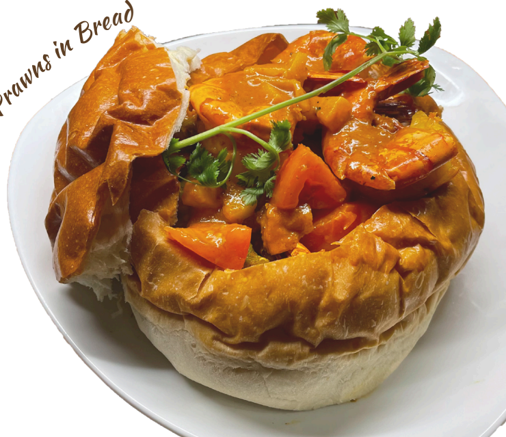
Curry Prawns in Bread