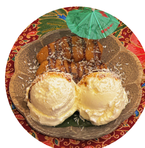
Pisang Goreng with Ice Cream