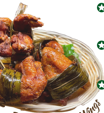
Pandan Chicken Wings