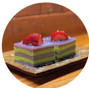
Taro Pandan Layered Cake