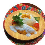
Mango Sticky Rice