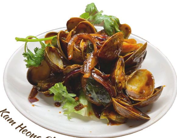
Kam Heong Clams